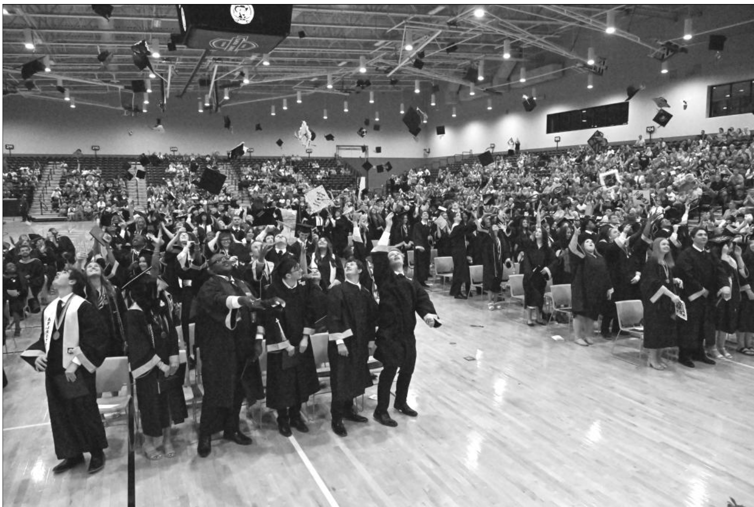
All hail to the 2026 graduates!

Congratulations to the Class of 2026 and GO CAVS!