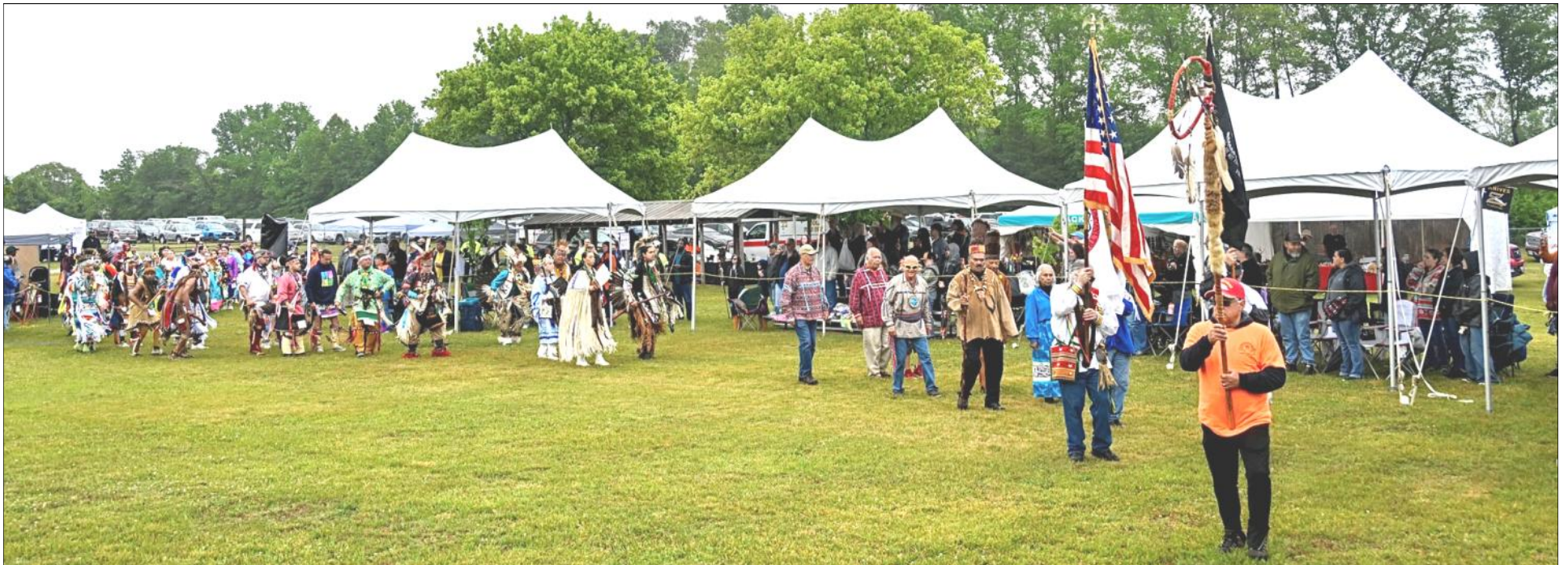
Grand entry procession