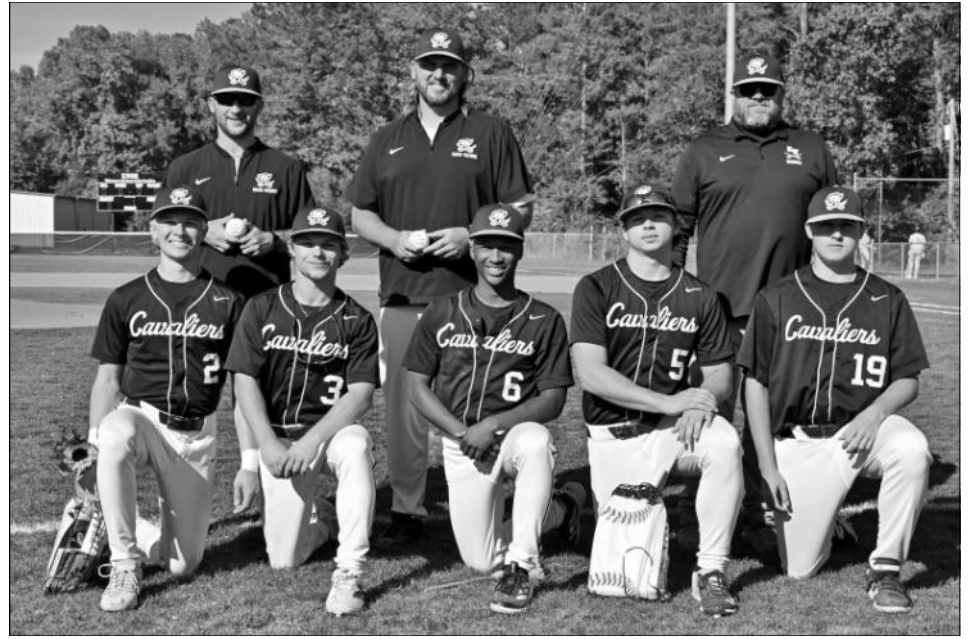
Senior players and coaches

The Lady Cavs Varsity softball team has also made headlines with their recent performances. In a dominant showing against the Charles City Panthers, the Cavaliers secured a convincing 10-0 victory. Freshman