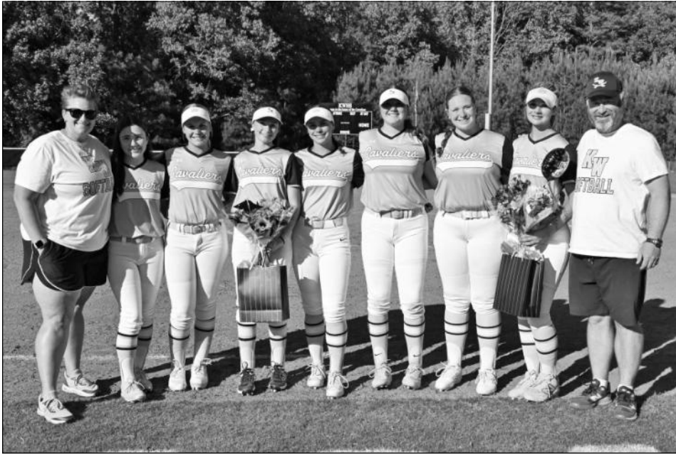
Lady Cavs senior players and coaches