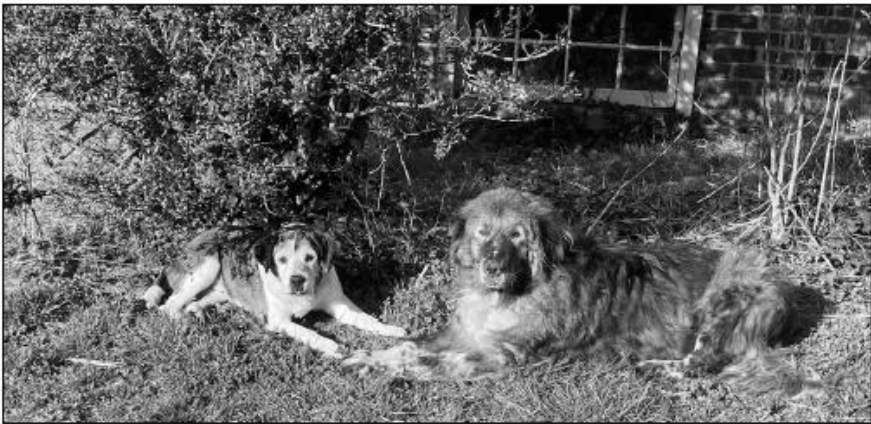
The late & great Buster and Kuche (taken in 2021)

I have been providing computer service and support to local businesses and residents in King William and surrounding areas for over 20 years.