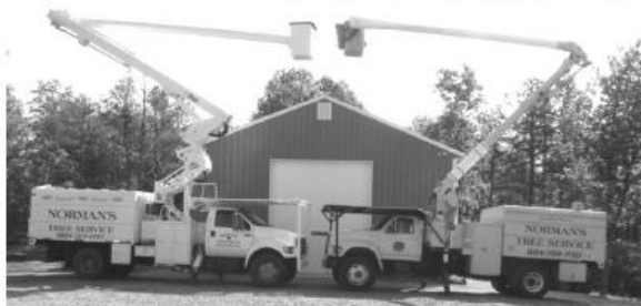
75 ft. Bucket Truck