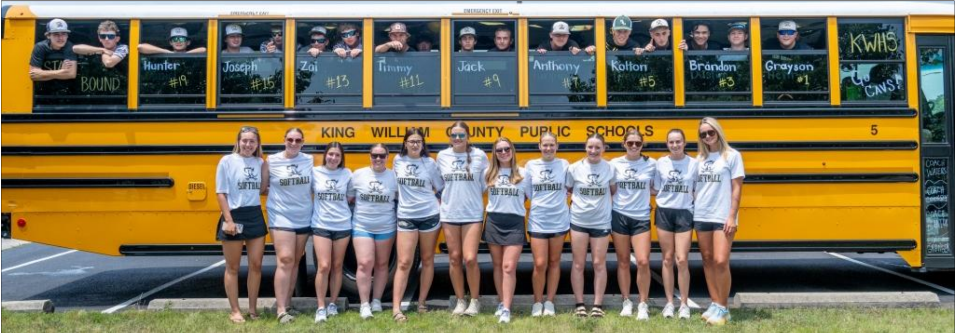
Cavalier girls and boys teams head to VHSL Class 2 State Tournament in Salem