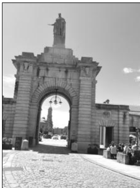
Gateway to the Royal Shipyard - The statue is King William IV.