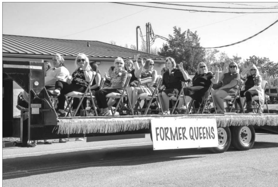
Former Walkerton Queens waving to the crowd