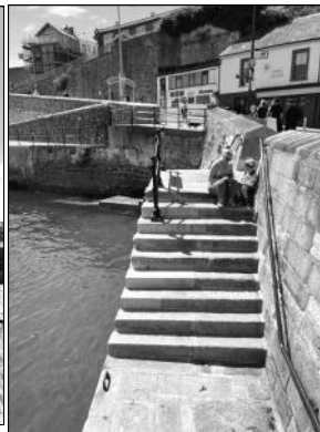
The actual steps the pilgrims walked down to board the Mayflower (with random tourists sitting on those steps!)