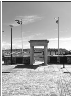
The monument marking the steps where the pilgrims departed and the connection between the United States and England