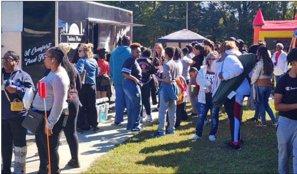
King and Queen residents lined up for delicious food at the Community Pride day.