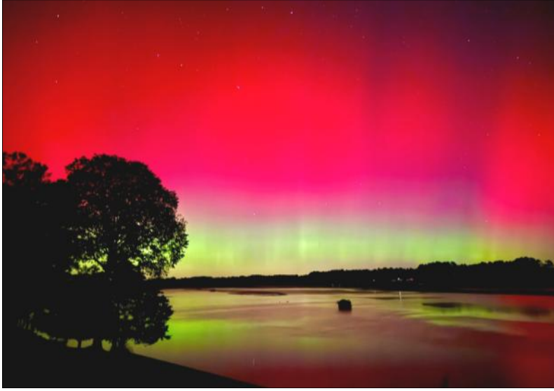
The Northern Lights over the Mattaponi River October 10 th by Gene Campbell Page 19.