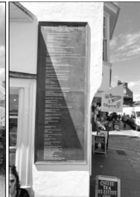
Plaque showing those who departed from Plymouth aboard the Mayflower.