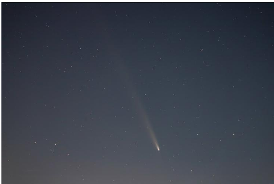
C/2023 A3 (Tsuchinshan-ATLAS October 17 th from Aylett