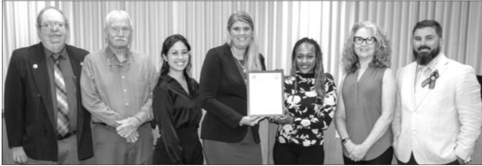
Members of the Board of Supervisors with representatives from Thrive Virginia proclaiming October as Domestic Violence Awareness Month.