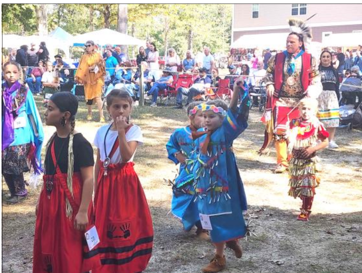
The young will no doubt keep the traditional ways of their ancestors alive.