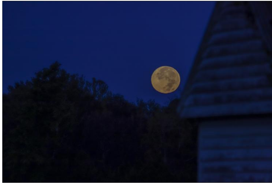
Full Hunter's Supermoon