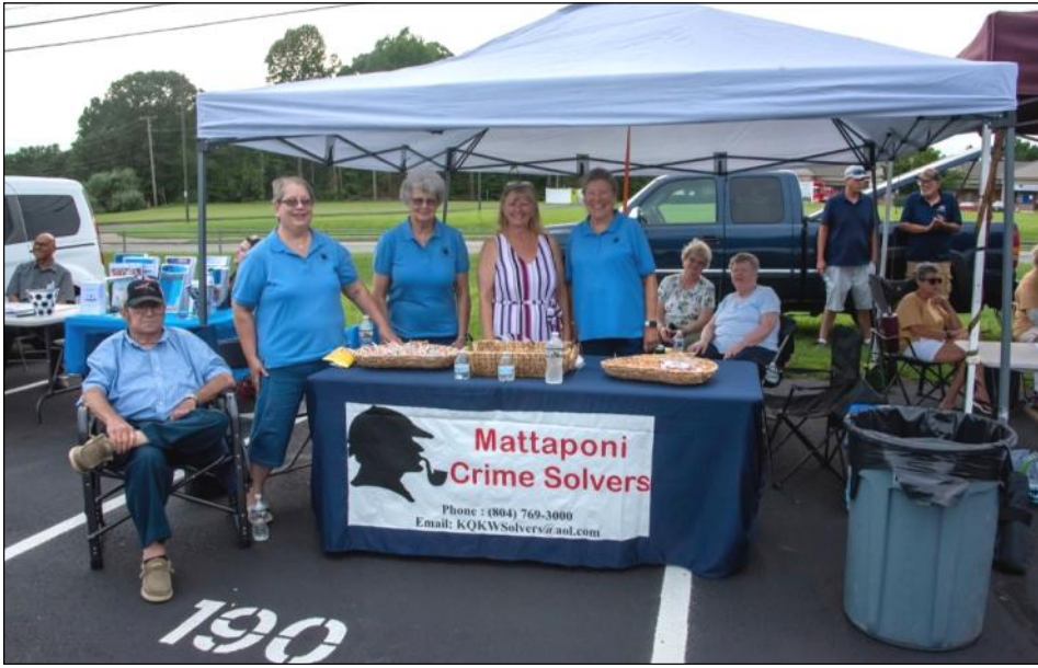
Mattaponi Crime Solvers

Since its launch in 2016, National Night Out has become a staple in the King William community. This year's event co-hosted by the King William Ruritan Club and the King William Sheriff's Department took place at the King William High School parking lot on Tuesday, August 6th. National Night Out is celebrated on the first Tuesday of August in communities across America every year. It brings together community members and law enforcement for an evening of fun, fellowship, and crime prevention awareness and serves as a platform for strengthening the bond between them.