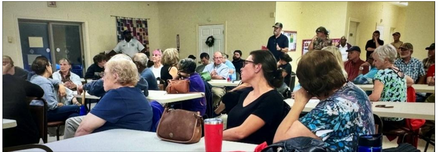
Citizens asking questions at fifth district town hall meeting