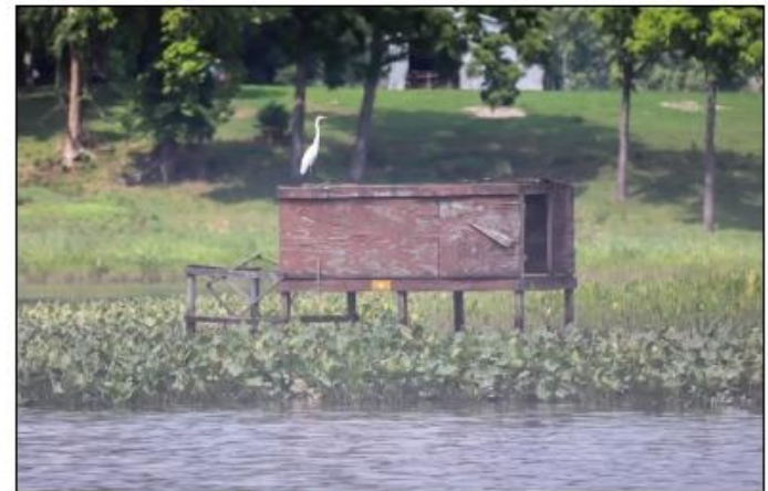
A Great Egret resting on a duck blind on the Mattaponi

I have been providing computer service and support to local businesses and residents in King William and surrounding areas for over 20 years.