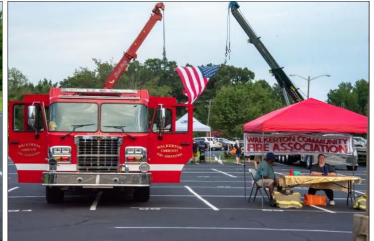
Walkerton Community Fire Association