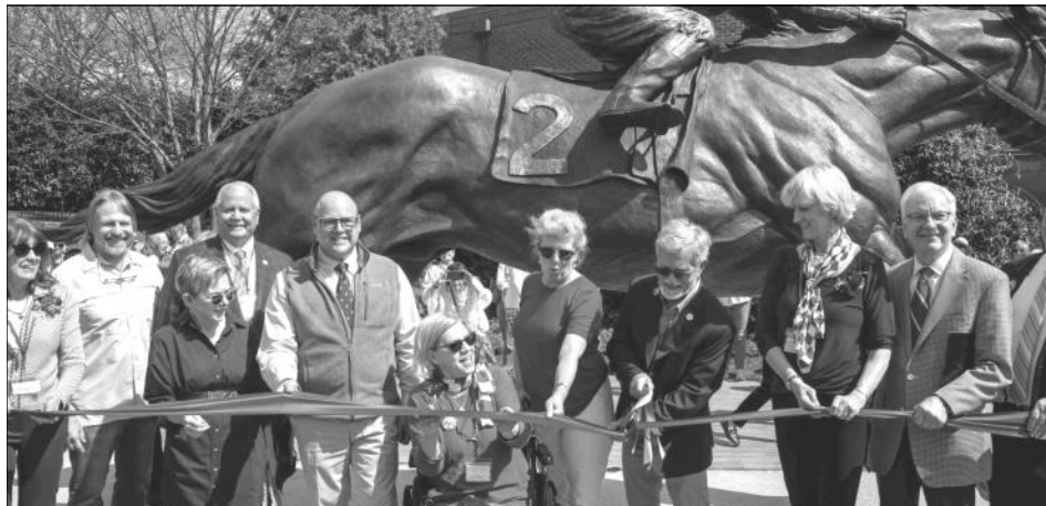
Ribbon cutting ceremony with dignitaries including Kate Chenery Tweedy