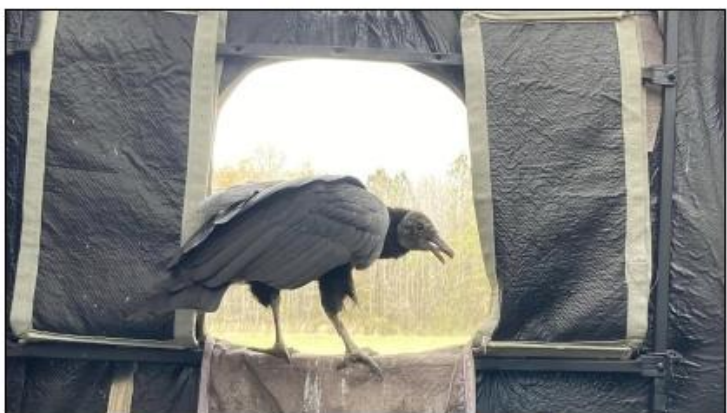
I have a Black Vulture that is nesting in an old deer stand. She has two eggs that should be hatching soon!

I have been providing computer service and support to local business and residents in King William and surrounding areas for over 20 years.