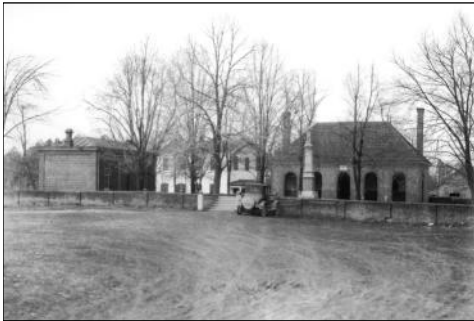
King William Courthouse in the 1920s