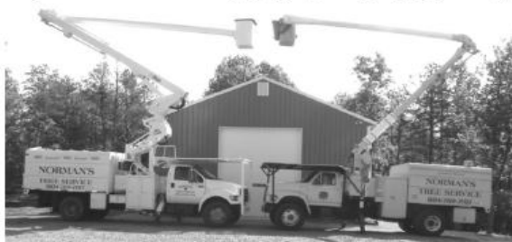
75 ft. Bucket Truck