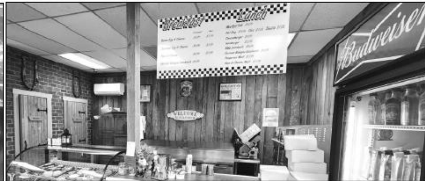
Located inside Jake's Tire and Auto Exxon in Manquin

Made Fresh Daily • Business & Corporate Orders Welcome • Made to Order Breakfast and Lunch Specials