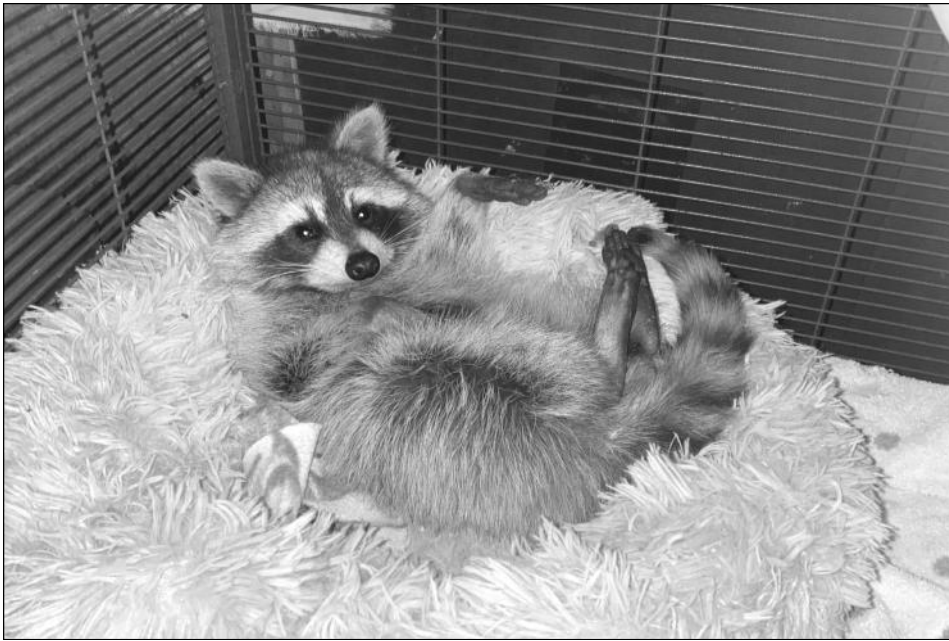
Brownie, a juvenile raccoon, was rescued in West Point in December