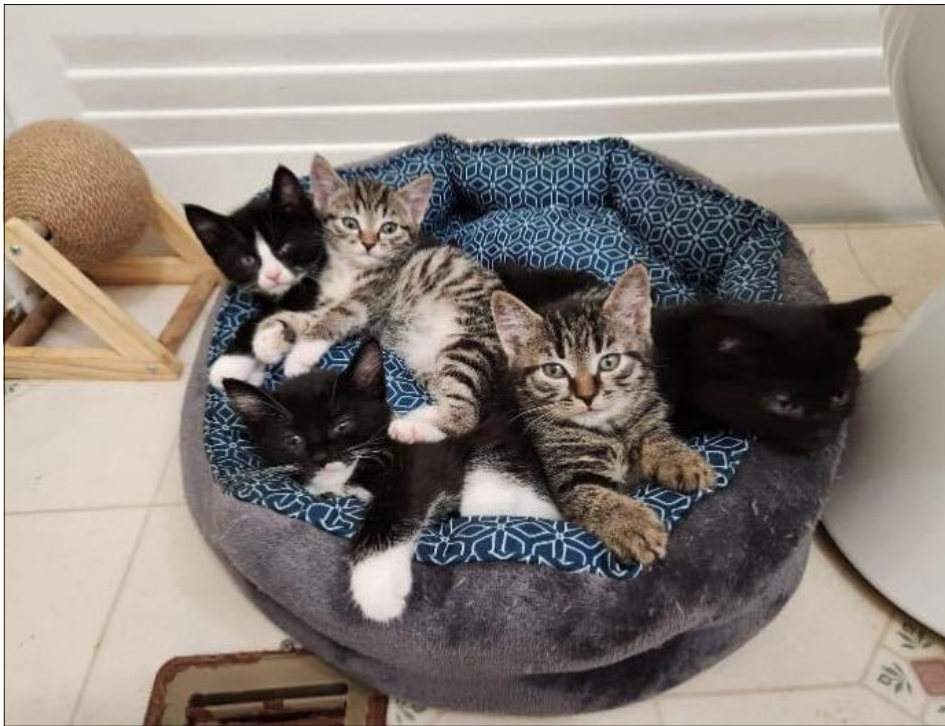
Bottle fed litter rescued from Regional Animal Shelter. All have furever homes!