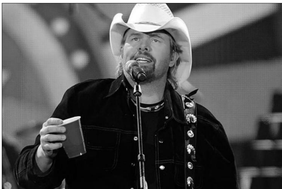
Toby Keith and his Red Solo Cup....let's have a party!