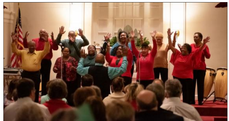
Combined choirs of Third Union & Trinity Baptist Churches

Please see CELEBRATION OF SONG, on page 15.