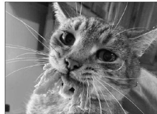
Tater Tot with a mouth full of bacon!

The fun part of having rescue animals is sometimes they're food aggressive. Tater Tot grabbed a slab of bacon off of the kitchen counter and took off. I scuffed him and he growled and wouldn't release the tasty treat. I ripped the slab of bacon recovering what I could, and he got to keep the rest.