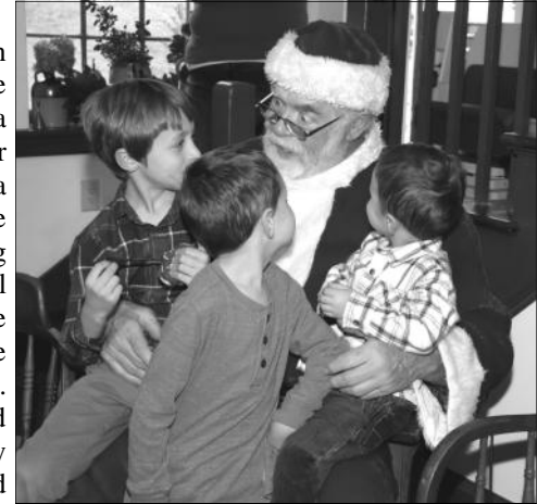
You want what for Christmas??

The day ended with the lighting of the Christmas tree. Everyone gathered around the tree as the lights were turned on. The day was a perfect blend of history, food, and holiday cheer. If you haven't visited the museum, I highly recommend you to. You will not be disappointed!