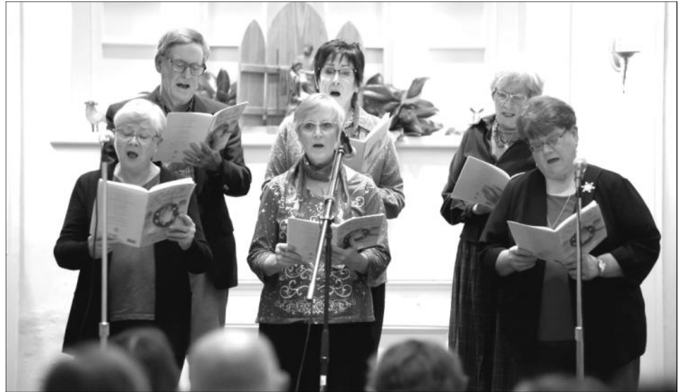
Choir members of McKendree Methodist Church