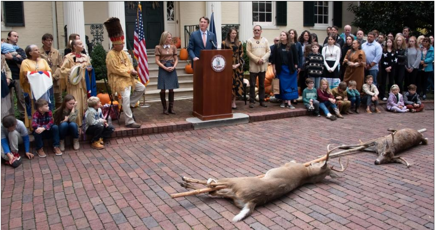
Mattaponi and Pamunkey Indian Tribes present tax tribute