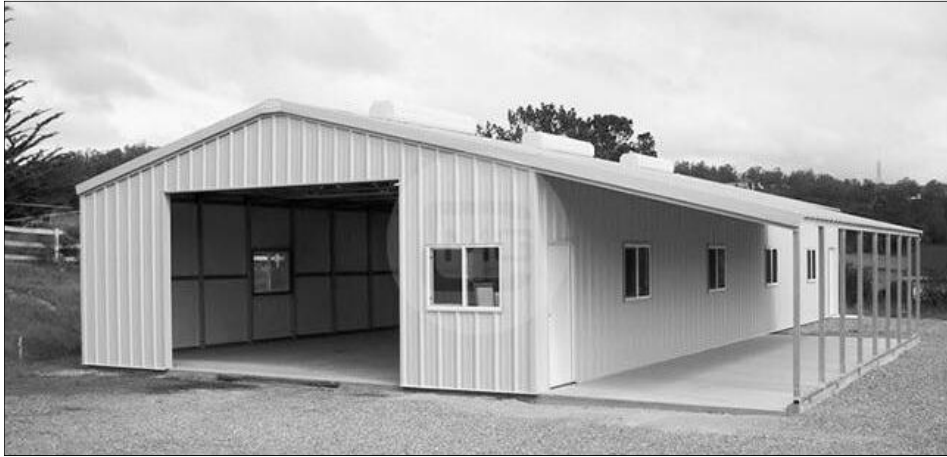
Maleena's Wildlife Rescue's concept for a new metal building for the animals.