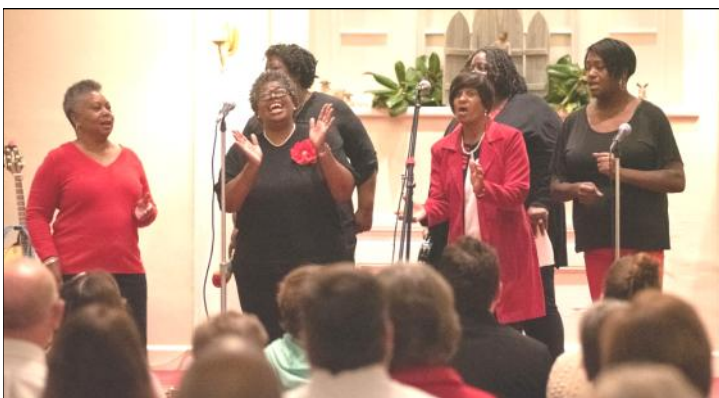
Choir of Rock Springs Baptist Church