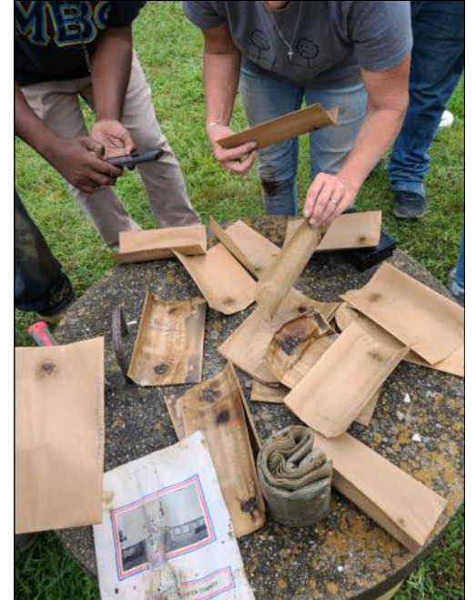
Contents of the Time Capsule