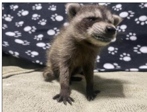
One of the 29 Raccoons