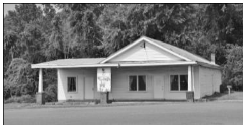
Central Garage Today