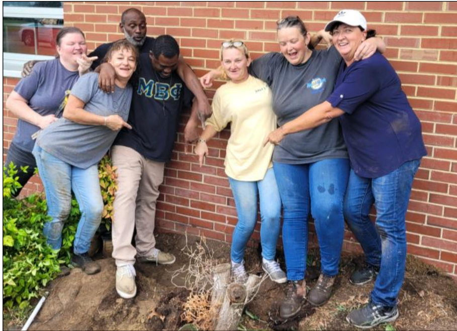
Students of the classes of 1988 and 1992 pointing to the burial location.