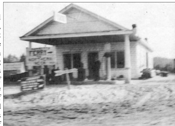
Central Garage as it was in the early 1900s

Ever wonder how Central Garage got its name? Well, when you stop and think about it, the way it got its name makes sense. When automobiles started appearing in the early 1900s, garages began to appear to take care of automobiles. One such garage was built at the intersection of old Rt 360 (now Rt 662) and Rt 30. The location of this garage was near the center of the county, therefore the name Central Garage. It also was