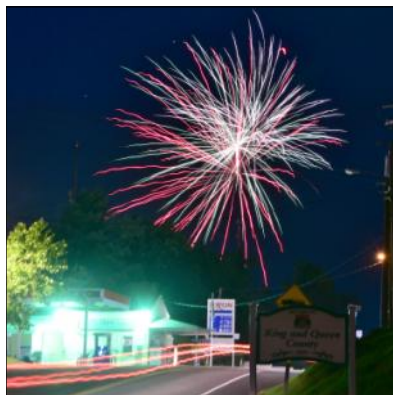
Fireworks in Walkerton