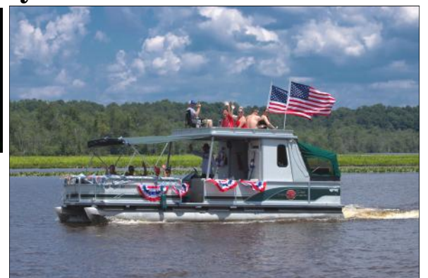
Annual Walkerton Patriotic Boat Parade 2021

The Country Courier staff hopes everyone had a fun and safe July 4 th . Due to the holiday we will not have any coverage until our next issue. Here are some blasts from the past!