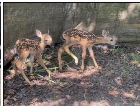
Two baby fawns