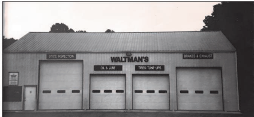
Waltman's Auto Repair in 1991

Waltman's is now reopened in King William. Waltman's opened in 1990 and outgrew the original building. Now after an 11 year break we're back in business!