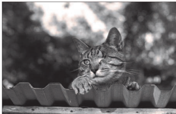
Mr. Good Times

Mr. Good Times was rescued as a feral kitten in Richmond with several of his siblings. He got in a fight and lost an eye, but that doesn't slow him down. He spends most of his time outside on the farm with his cat and dog friends.