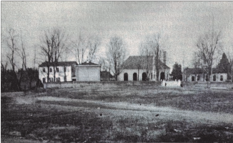
The Puller Tavern (far left) at the King William Courthouse Complex in the early 1920s