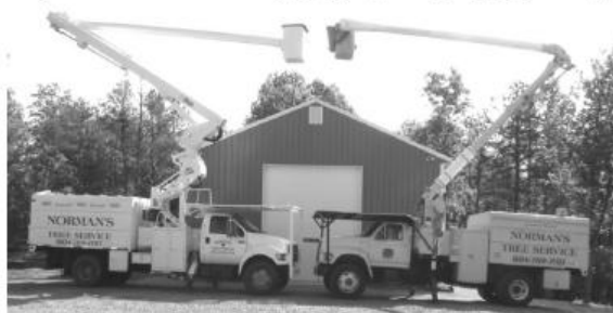
75 ft. Bucket Truck