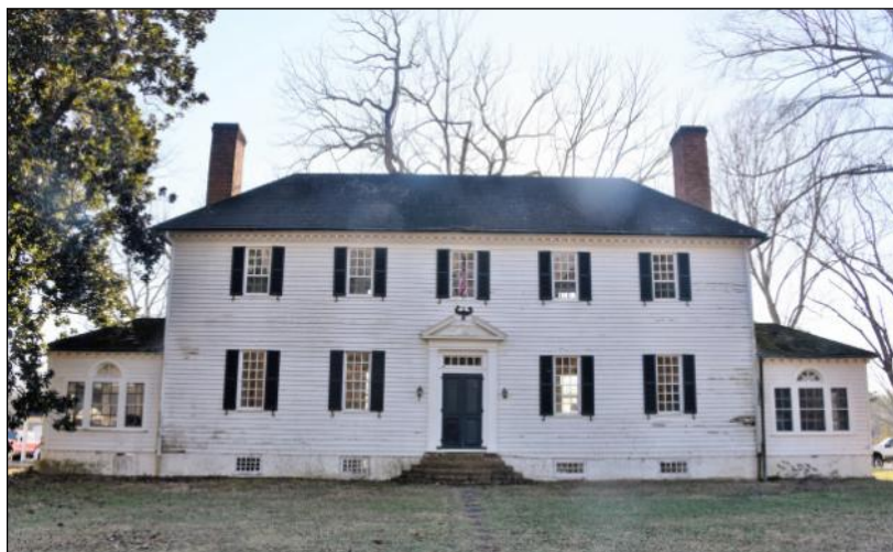
Mid-18th century Warsaw