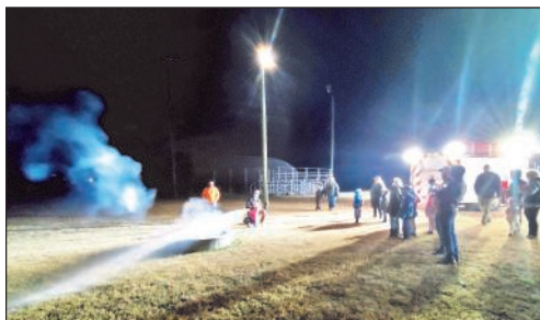
The kids got to help put out the bonfire.

Cub Scout Pack 360's meeting theme was fire safety. On January 13 th the scouts met at the Upper King and Queen Ruritan Park. The Walkerton Fire Association brought Engine 7 with a crew to review fire safety such as smoke detectors, escape plans, and demonstrating how a firefighter dons his gear. They then gave the scouts a tour of the engine and all of the equipment stored on it. Before they left we had a fire going in our campfire ring and the engine crew let all of the scouts take turns using the hose from the engine to put the fire out. The Walkerton Community Fire Association stated, "The kiddos were wonderful and super curious about all things fire safety... they asked lots of questions and really enjoyed our demo, getting in the truck to look around, and putting out the fire in the fire pit."