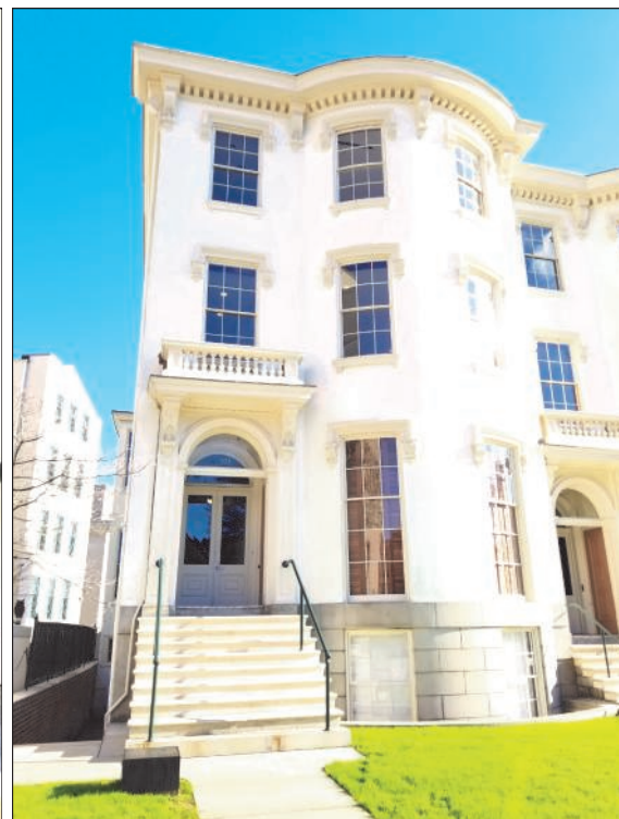
The Townes House