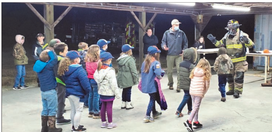
Scouts inspecting the fireman's gear.