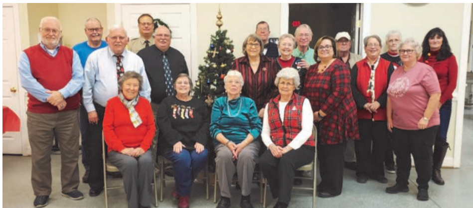
Who stole the Sheriff's gift?