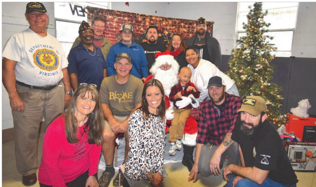
Sage Ministry volunteers and American Legion Post 314 members pose with Santa.