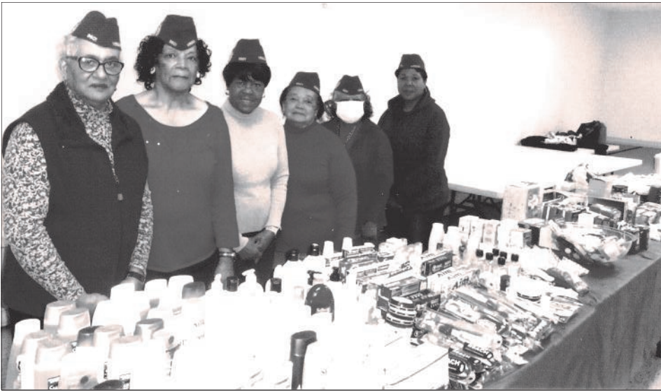
Members showing some donated items.