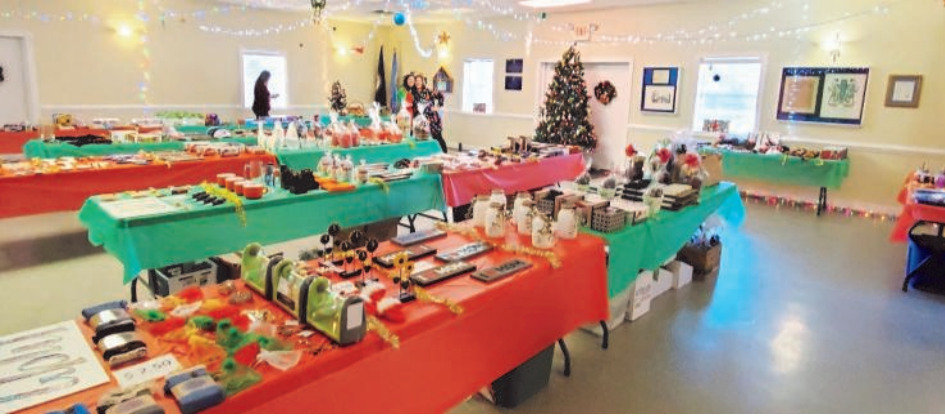
The for "kids' eyes only" Elf Cottage Store

Over the past five years, we have been blessed by a constantly growing support system of volunteers, sponsors, and patrons that allows us to create a mini Christmas Wonderland one weekend a year where children can shop for their families with the help of volunteer elves, wrap their gifts and surprise their loved ones with their hand-picked treasures Christmas morning with all proceeds benefitting a group that is very near and dear to many of us- The American Cancer Society.