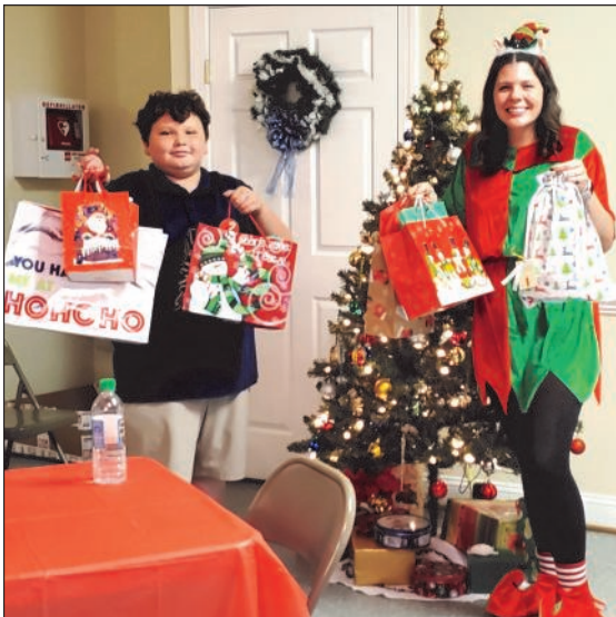
Shopper with his personal Elf ready for Christmas Morning