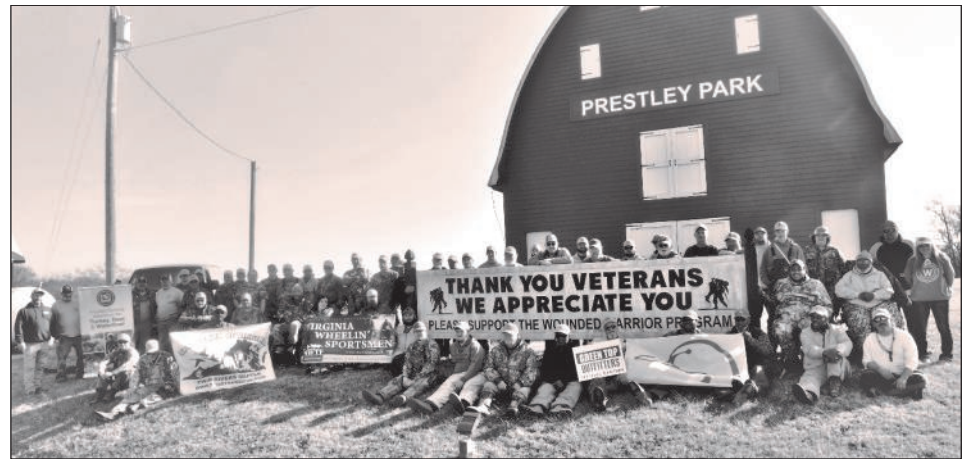
Hunters regroup before the afternoon hunt