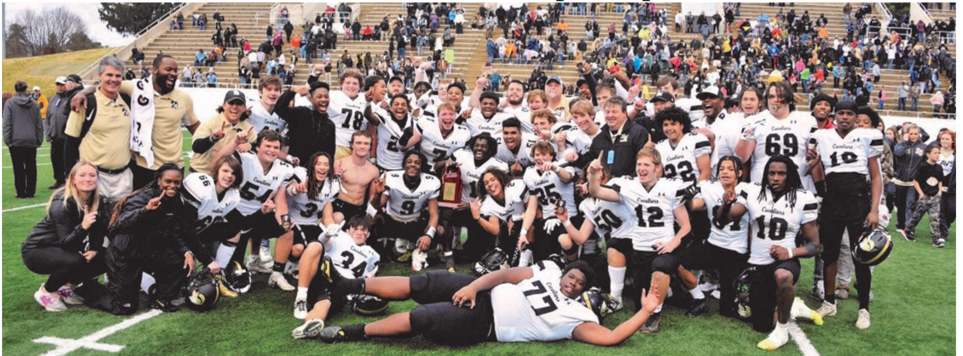
The gang's all here....2021 State Class 2 Champions!!