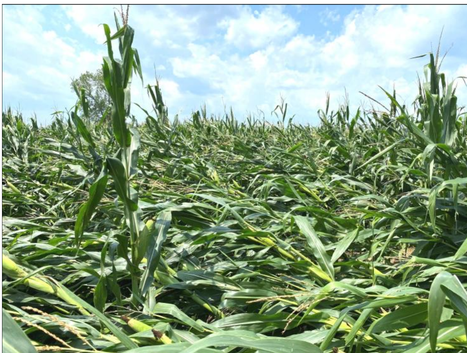
Upper K&Q, one of many corn fields damaged by this storm.

The storm with wind gusts of up to 70 mph, blew down trees, knocked out power service, damaged property, and blocked some roads. A few areas reported hail in addition to the heavy rain. The caused power outages for over 1,000 customers of Dominion Power and Rappahannock Electric Cooperative.