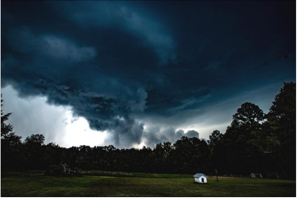
The storm over Aylett at 6:47 PM Thursday evening.