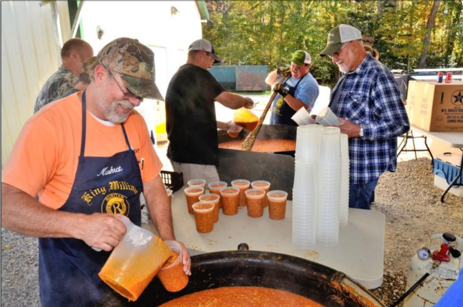
Ruritan members preparing their delicious Brunswick stew