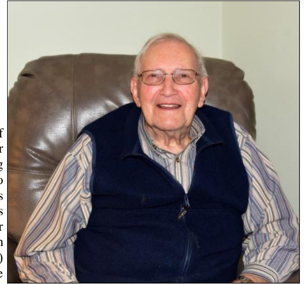
Looking sharp at 94!