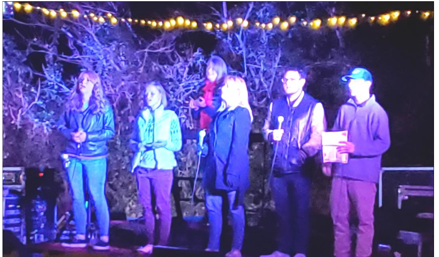
Passion Community Church singers lead crowd in singing Christmas Carols