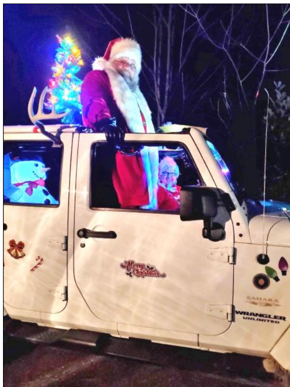
Santa & Mrs. Claus in their Jeep