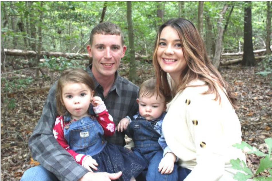
Capel family is displaced by house fire.