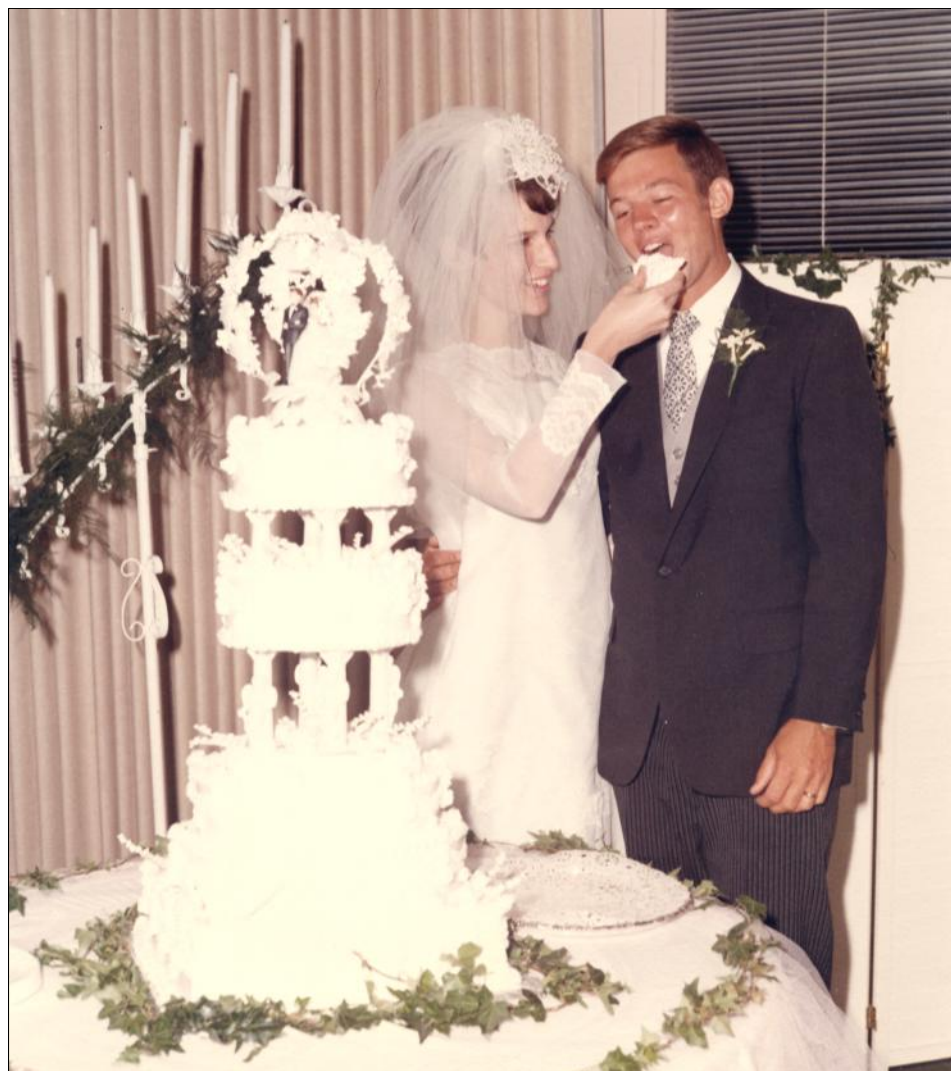
The Rudolph's fifty years ago