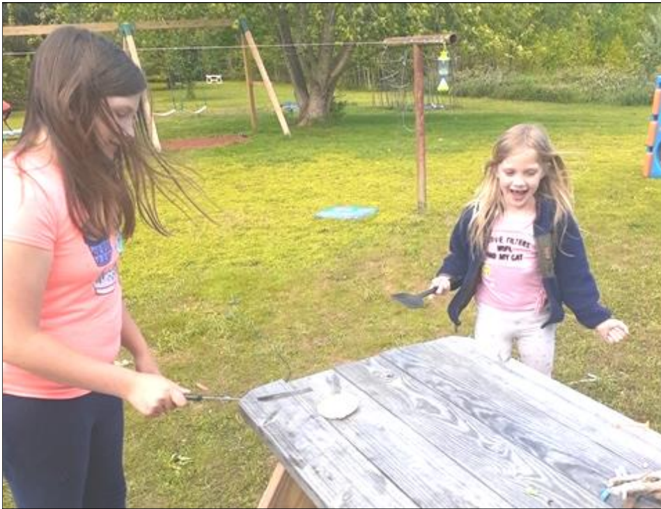
Field day event