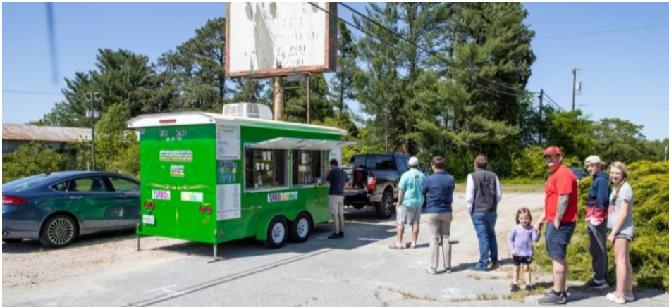
Waiting in line marked for social distancing for a Turbo's Snowball