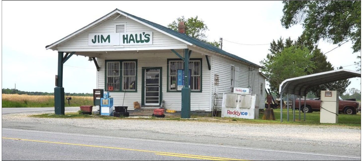
Jim Hall's Store sits at the crossroads of Rt. 30 and Rose Garden Rd.