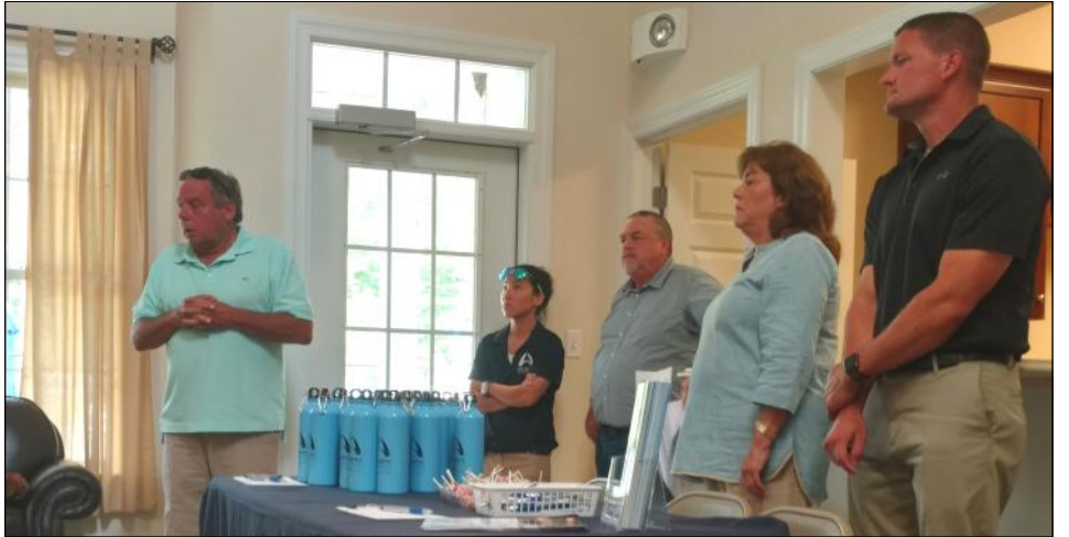
McCauley Park Residents updated on Atlantic Broadband Internet, TV and Voice Service