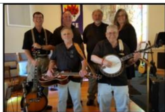
BLUEGRASS GOSPEL CONCERT